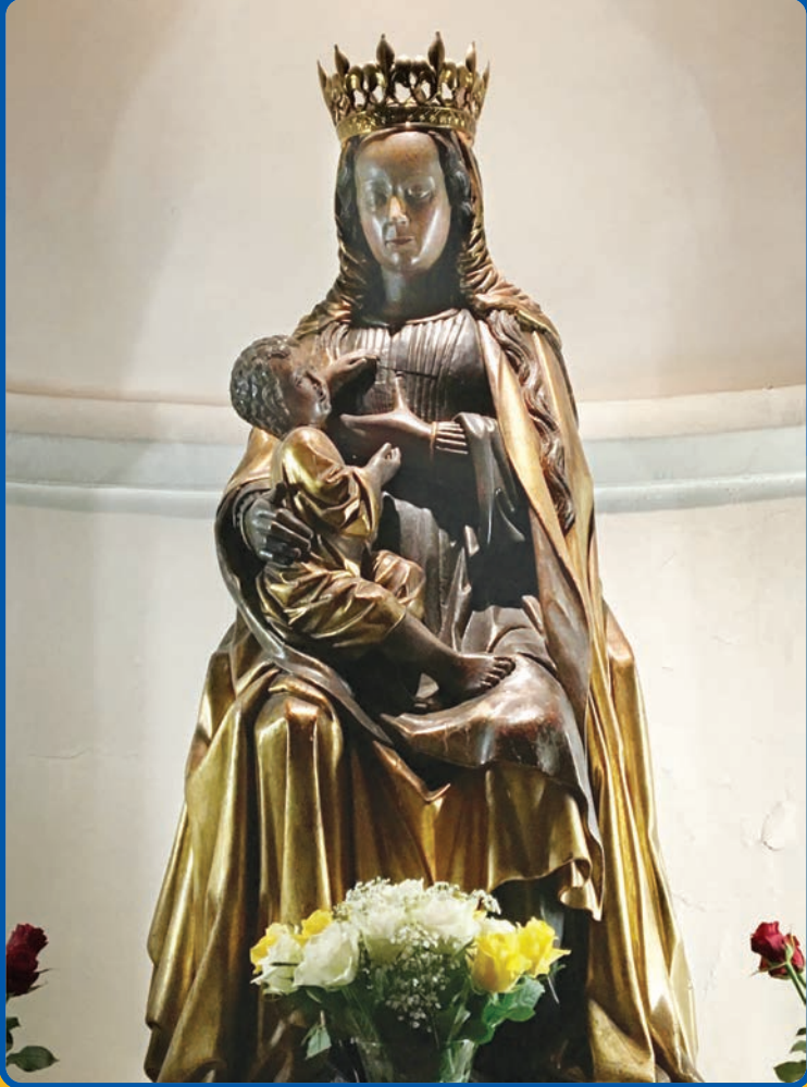
The Shrine of Our Lady of Caversham, Berkshire.

The Superior-General, the Chaplain-General, Officers and General-Council of the Society wish you all a Happy Eastertide.