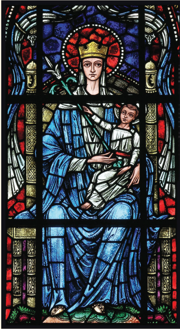
Our Lady of Walsingham. Window in the RC Cathedral, Norwich.

(And whether it is Dormition, Falling Asleep or Assumption) It is most definitely an Assumption! As Mary is raised body and soul to the glory of heaven, so we see the true dignity of the whole human person and are reminded of our own promise to share in the glory of heaven through Jesus Christ.